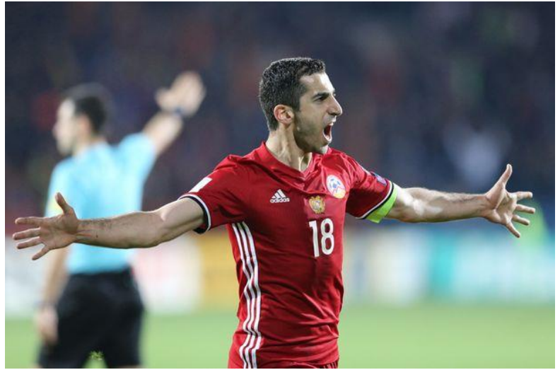
Mkhitaryan after scoring his goal against Kazakhstan

This put Armenia at 6 points overall in the table and currently fifth place in their group but only 1 point out of 2 nd place (only 1 point separating team #2-5). The next match will be in June against 2 nd place Montenegro, with a shot for Armenia to continue moving up the table. Armenia would need to finish in the top 2 in their group to have a chance because while only the top team in their group automatically qualifies for the World Cup, the second-place team would have a chance to make it through an additional playoff. Even though it seems like only an outside chance of making it to the 2018 FIFA World Cup in Russia, there is still a chance and as a fan, that is more than we could hope for.