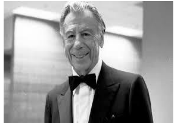
Kerkorian (above) at his 95 th birthday in 2012

Kirk Kerkorian's legacy will include him being one of the richest men in Los Angeles, building the MGM Grand Hotel in Las Vegas and purchasing the Metro-Goldwyn-Mayer Movie studio. For Armenians around the world, he will be remembered even more for his philanthropic contributions. Through his charitable foundation, he covered half the cost of an 80-kilometer highway connecting Armenia to Nagorno-Karabakh. He financed more than $200 million worth of infrastructure projects in Armenia. And in 2005, he donated another $60 million to reconstruct schools and streets in Armenia.